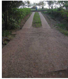
Our long driveway is kind of steep.

Now, we've been starting school up again and getting adjusted into our new house. We all have our own rooms now. Location is everything in Ukarumpa, because it is built on a hill.