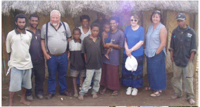
Village friends welcomed my parents. It takes a little walking on narrow trails to see them.